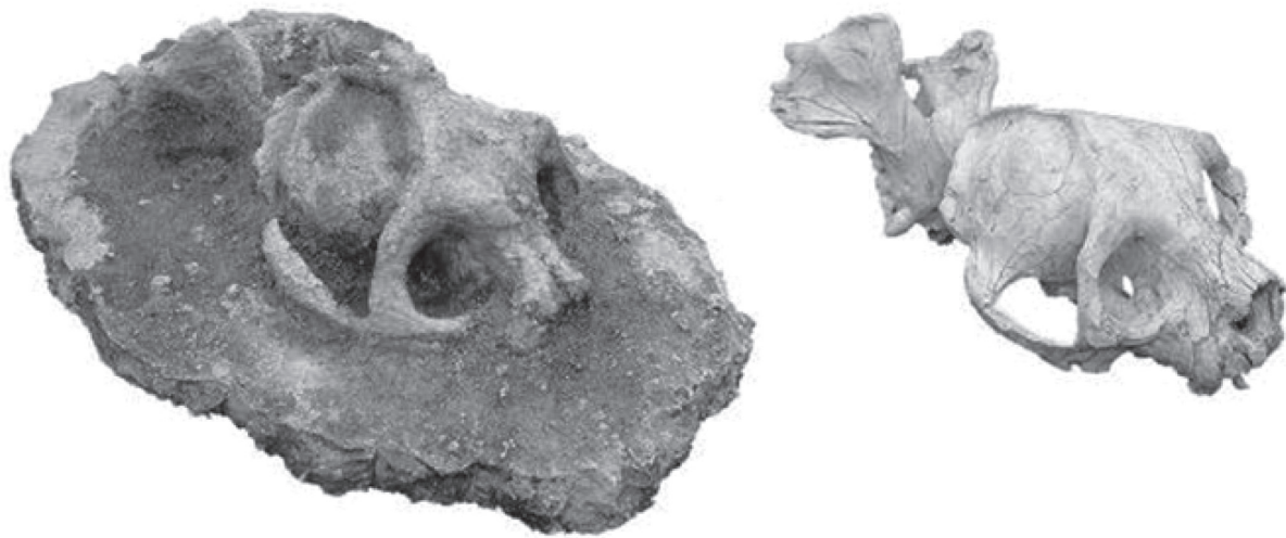
Figure 2. Skull and mandible of Archaeolemur sp. cf. A. edwardsi with associated matrix (left), and matrix removed (right) to show the approximate amount of material prepared in our sample. The skull and mandible are shown in the position in which they occurred in the matrix.

date the largest bone fragment ( Hippopotamus orbit UA 9570) was successful (see Results).